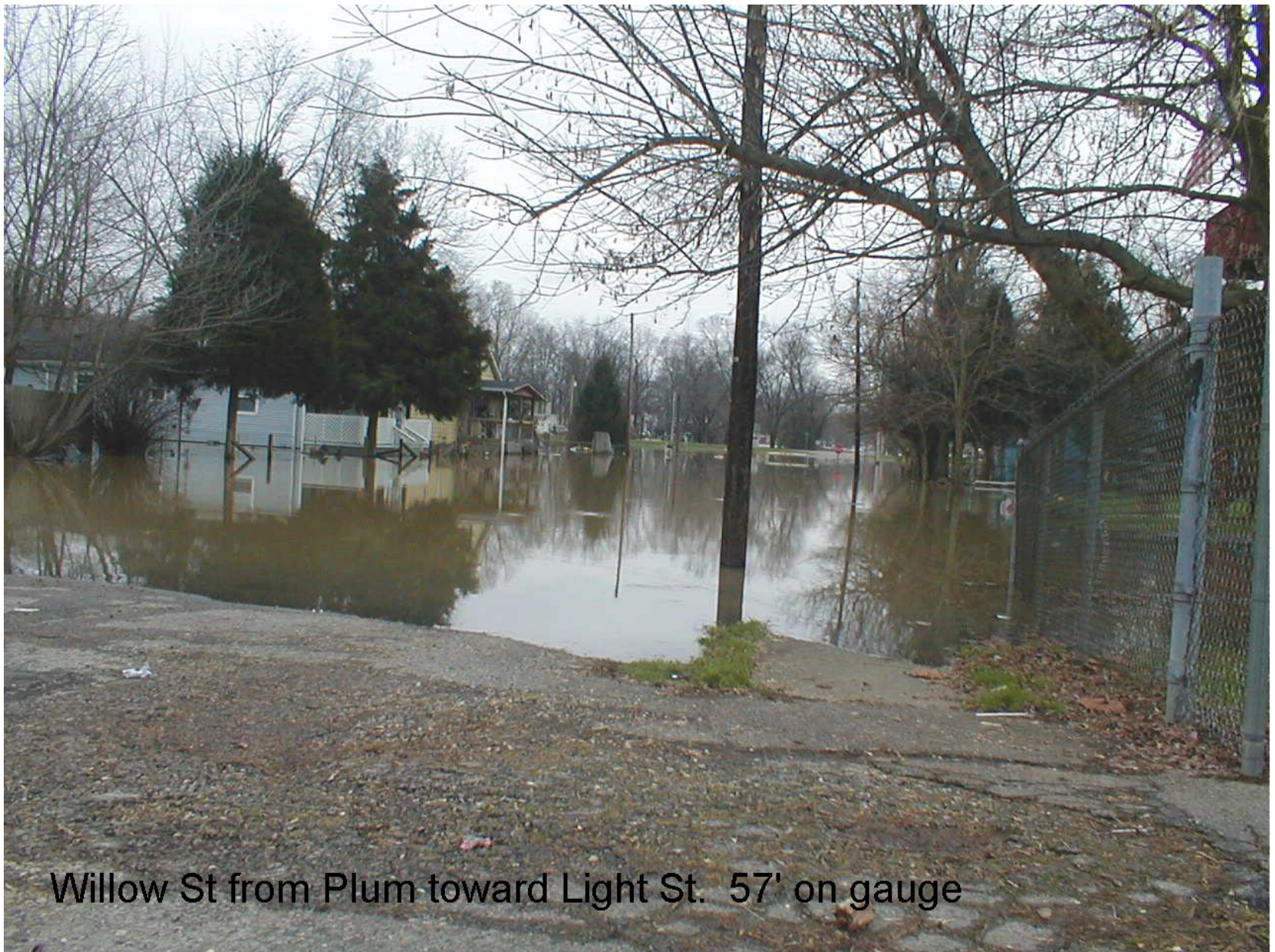
Willow St from Plum toward Light St. 57' on gauge