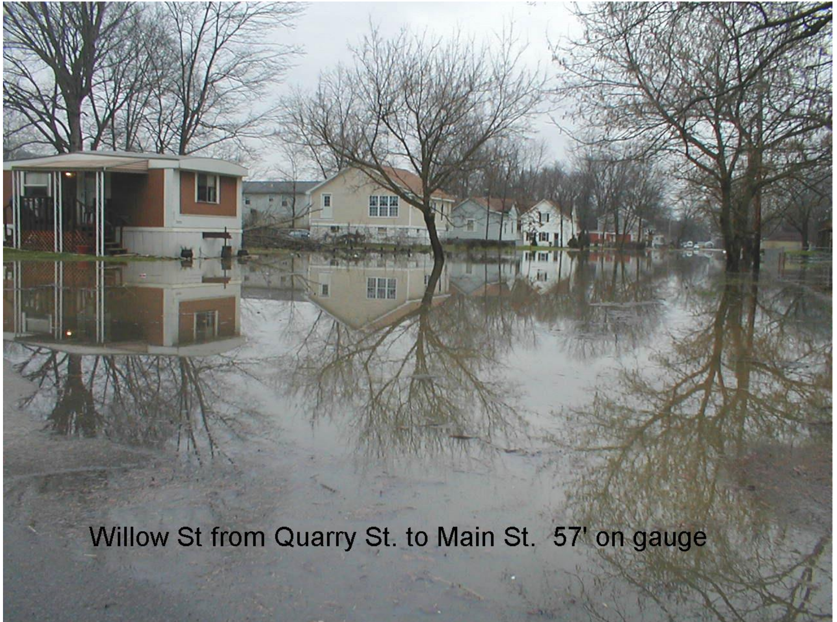
Willow St from Quarry St. to Main St. 57' on gauge