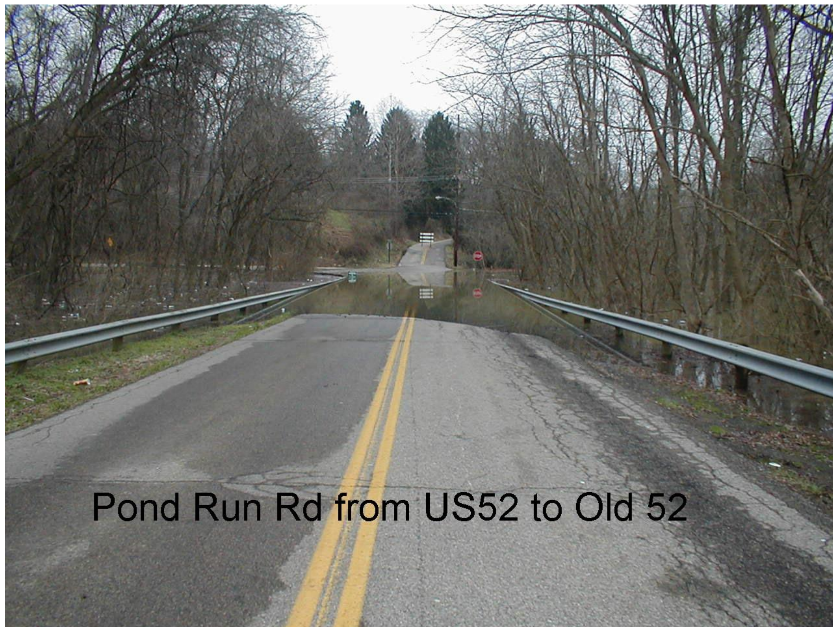
Pond Run Rd from US52 to Old 52