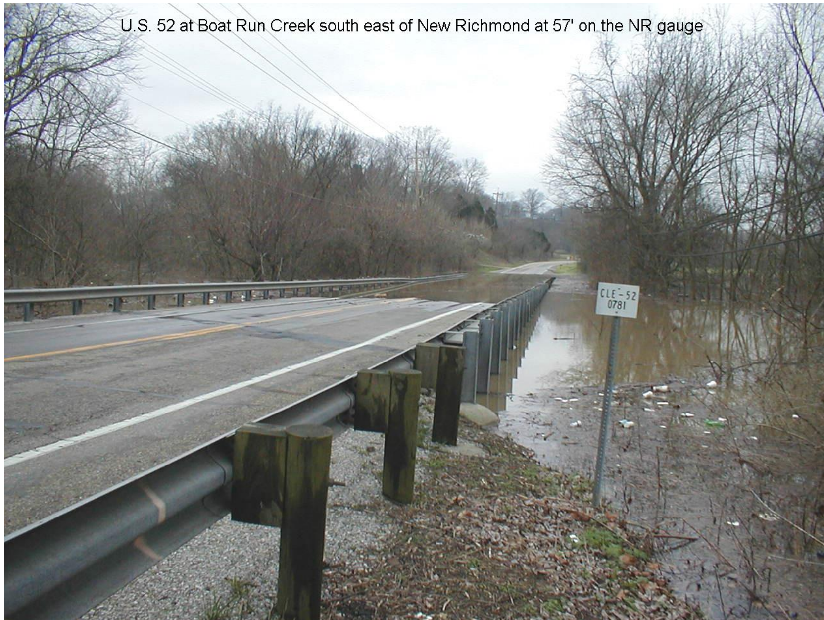
U.S. 52 at Boat Run Creek south east of New Richmond at 57' on the NR gauge