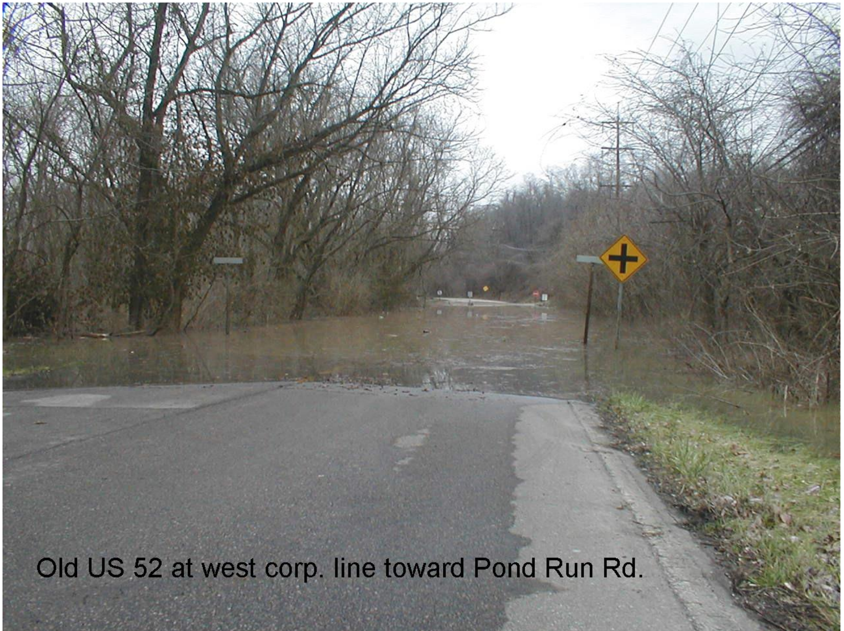
Old US 52 at west corp. line toward Pond Run Rd.