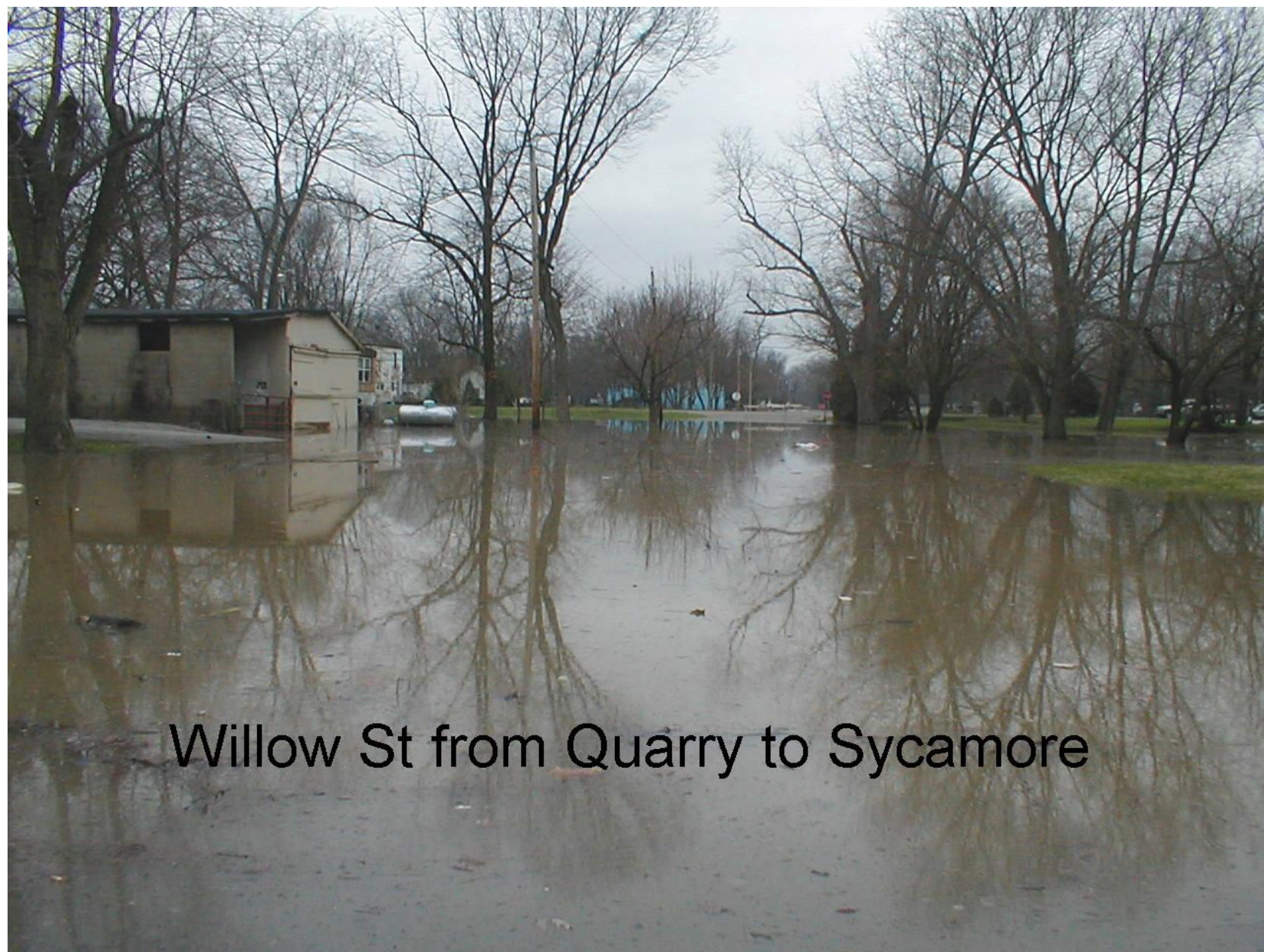
Willow St from Quarry to Sycamore