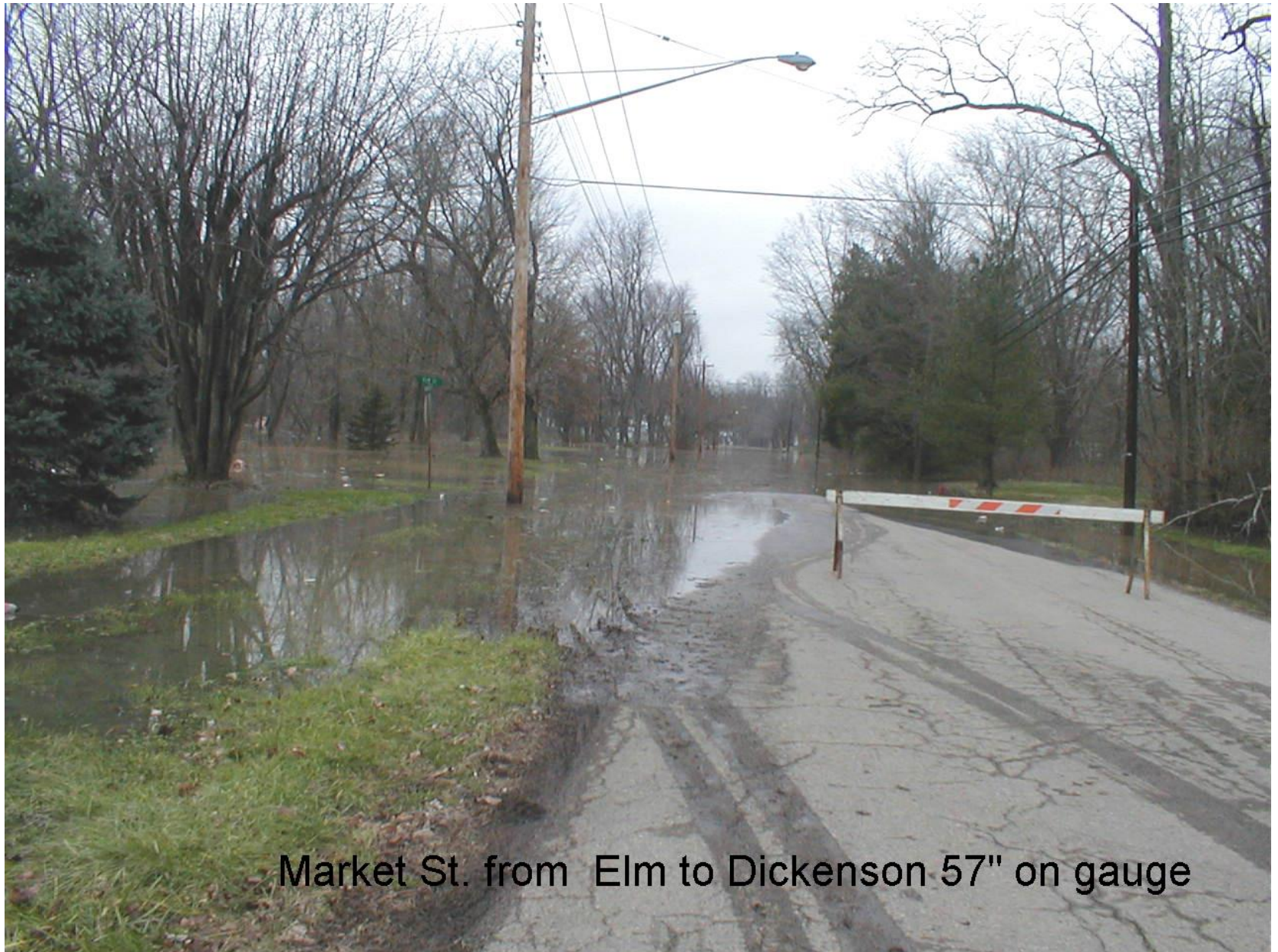
Market St. from Elm to Dickenson 57" on gauge