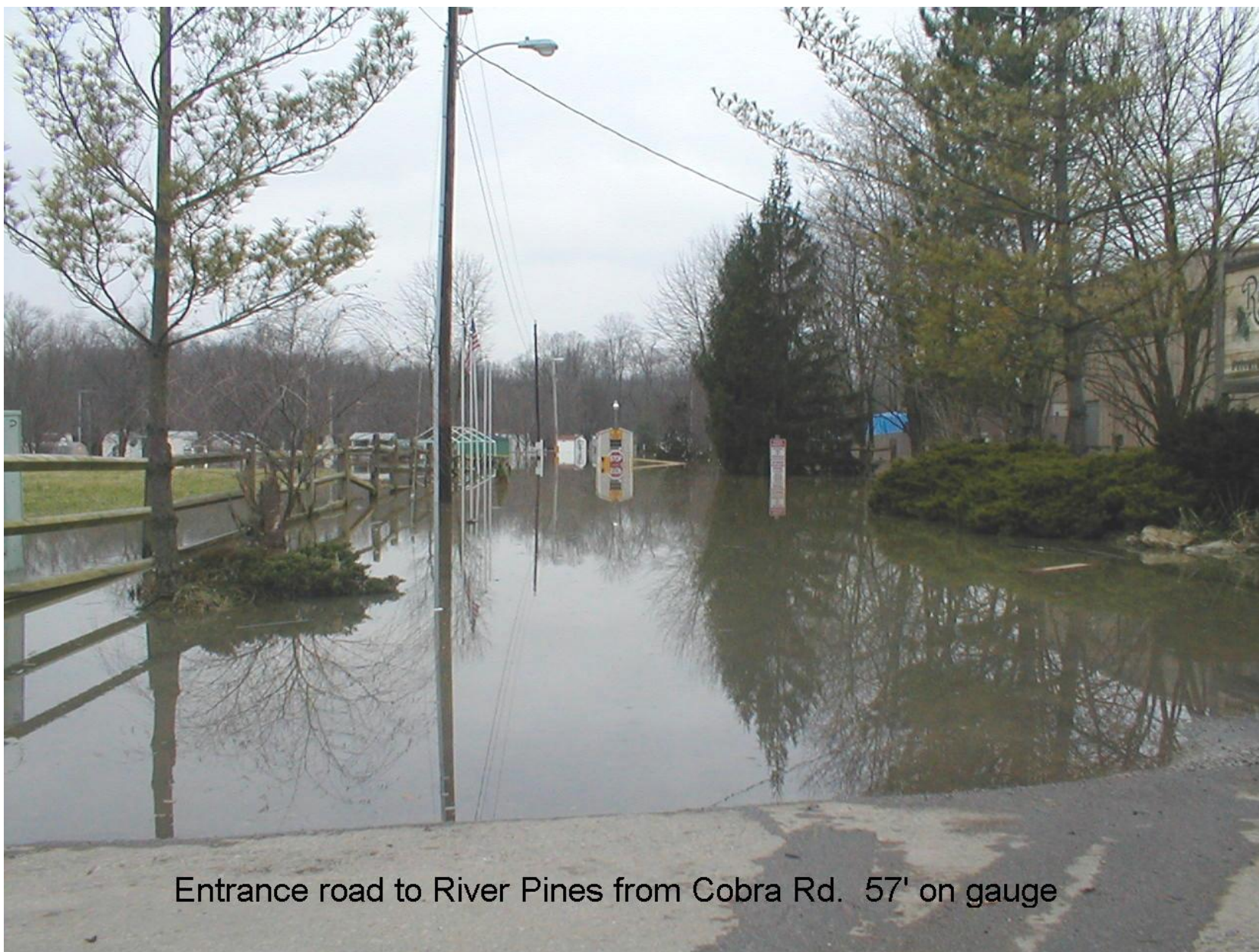
Entrance road to River Pines from Cobra Rd. 57' on gauge